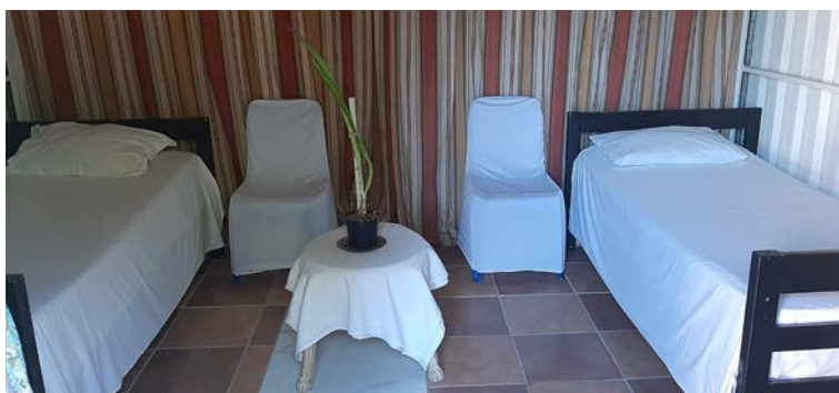
The isolation room where children returning from school are screened before they enter the centre.

"If the child has a fever or is not well, he or she stays in this room and is monitored carefully or taken to the doctor. We want them to feel comfortable and safe,"