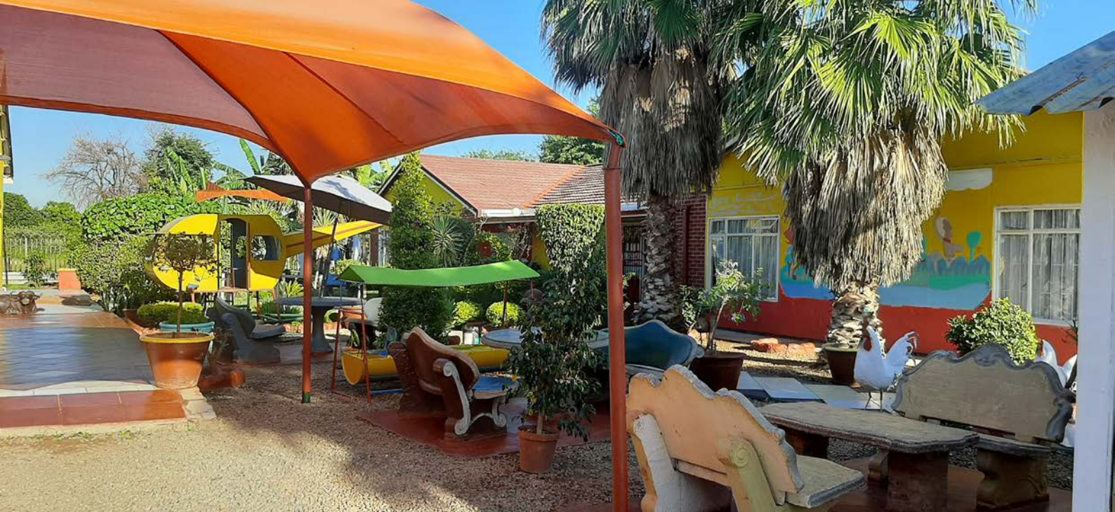
The colourful entrance and well-structured buildings and garden provide the orphans with a comfortable and safe home. It is also a place where other vulnerable children can find help and counselling.