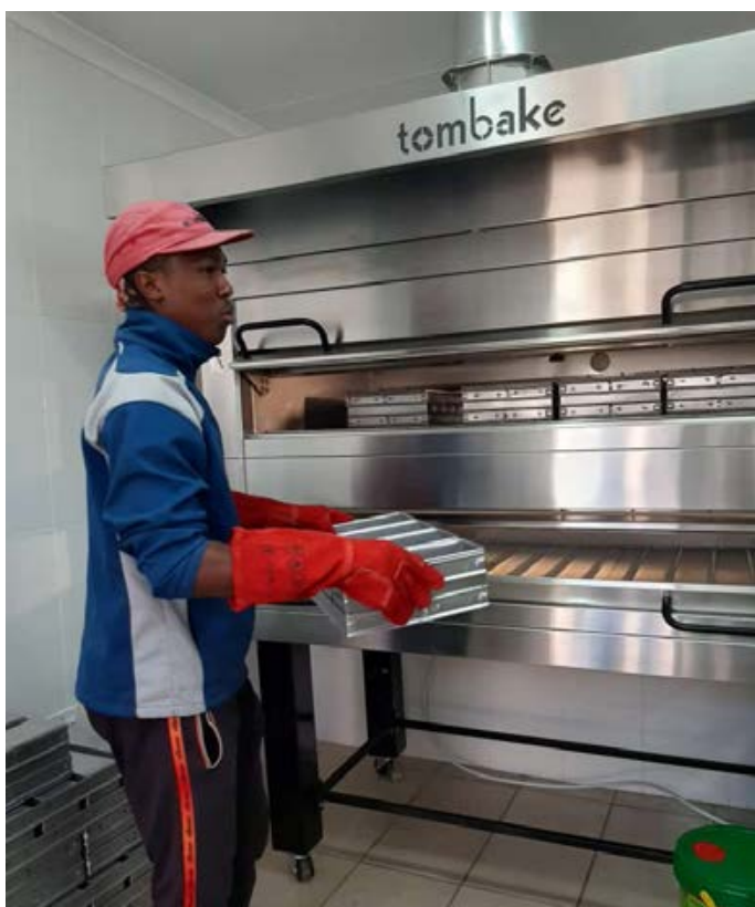
...the first batch of loaves went into the oven and not too long later ...