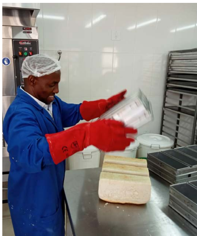
...beautifully baked fresh bread – the first batch of many to come for Lejwe la Thuso Bakery - saw the light.